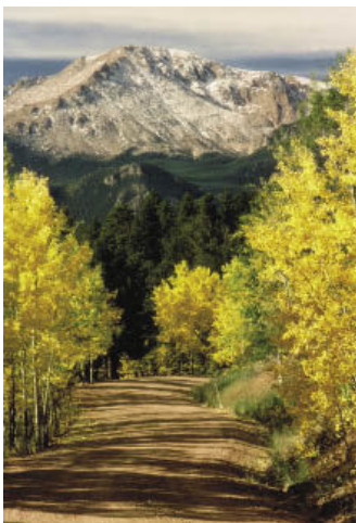
A view of Pikes Peak and a stand of Aspen trees in the fall.

Bates penned what has become our country's most famous poem and song, "America the Beautiful."