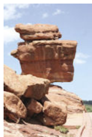
Balanced Rock is one of the most photographed images at the Garden of the Gods Park.

At the turn of the century, inspired by a trip to the summit of Pikes Peak, Katharine Lee