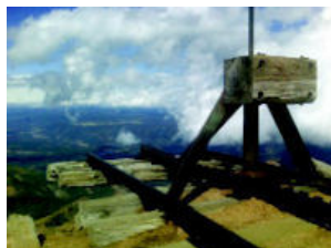
The end of the Cog Railway on top of Pikes Peak.

The Pikes Peak region lies along the extreme southwestern edge of what was the Louisiana Territory, which was purchased by President Thomas Jefferson in 1803.